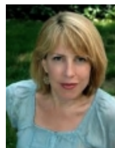
Christina Baker Cline