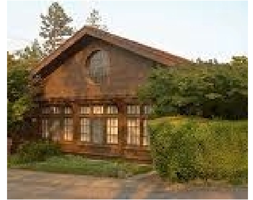
(Pictured above) Saratoga Foothill Club House is now 100 years old