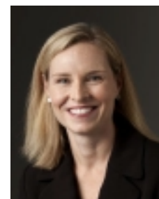
Mary Louise Kelly