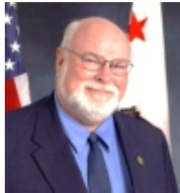
Senator Jim Beall