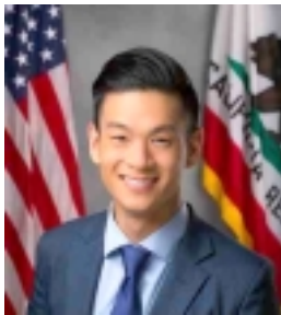
Assemblyman Evan Low