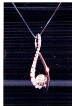
Above our lovely Diamond Pendant which features one 3/8 carat diamond and several small diamonds. Note that picture is larger than the actual pendant.